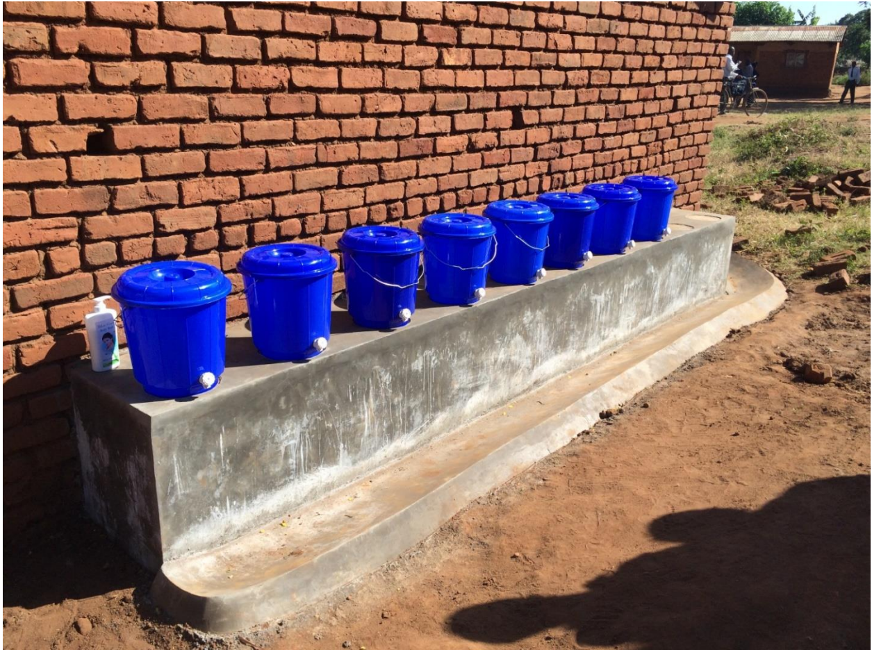
The Concrete Slab on which Tapped Water Buckets are placed for Teeth Brushing and Hand Washing Constructed against the Wall of the Classroom