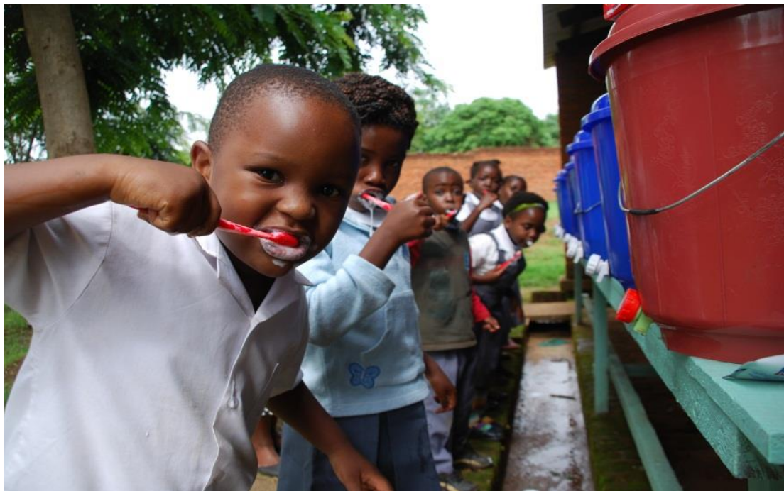
Learners Brushing Teeth with Fluoride Toothpaste