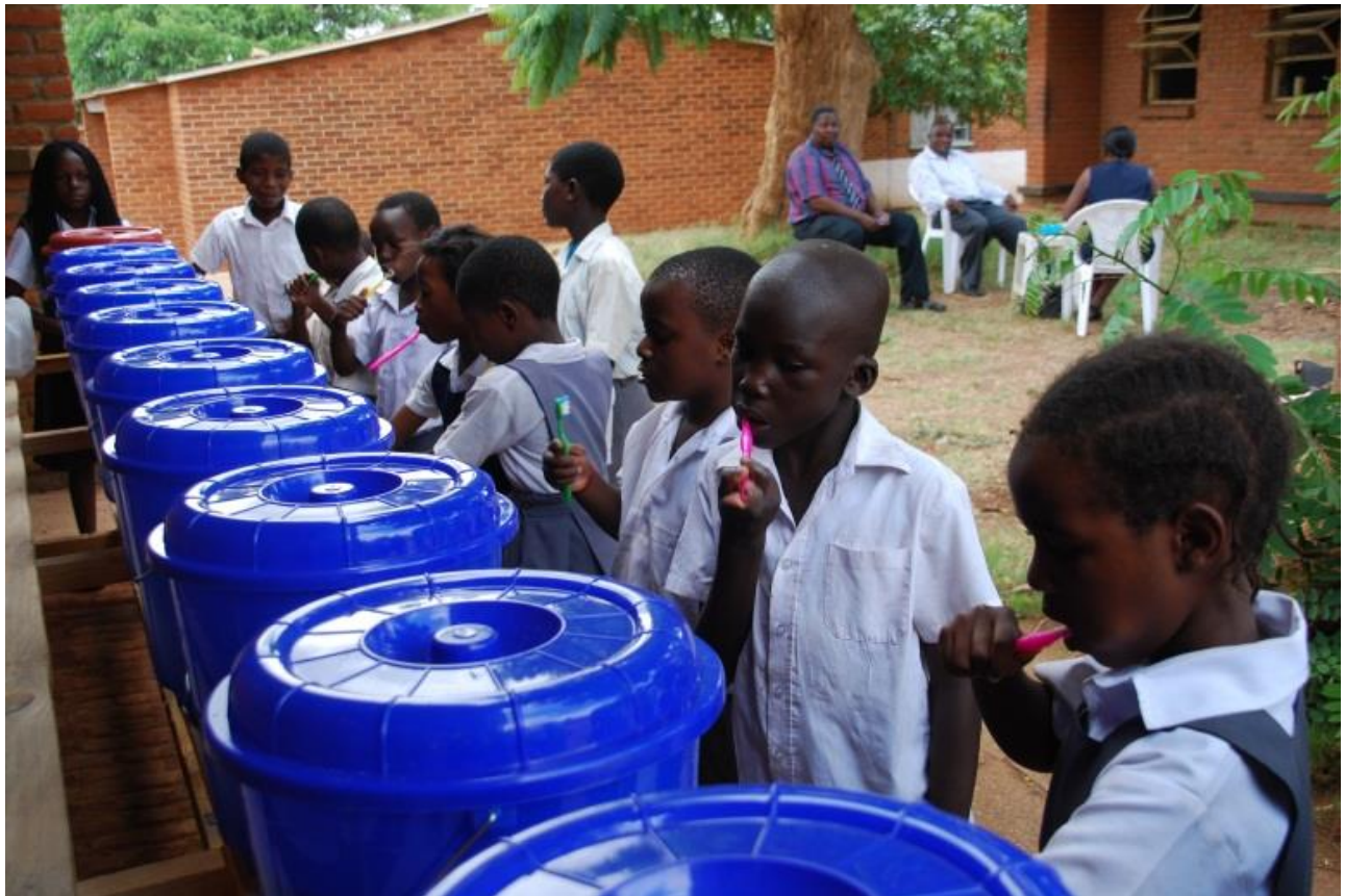
Learners Brushing Teeth using Water from the Tapped Buckets Monitored by Teachers