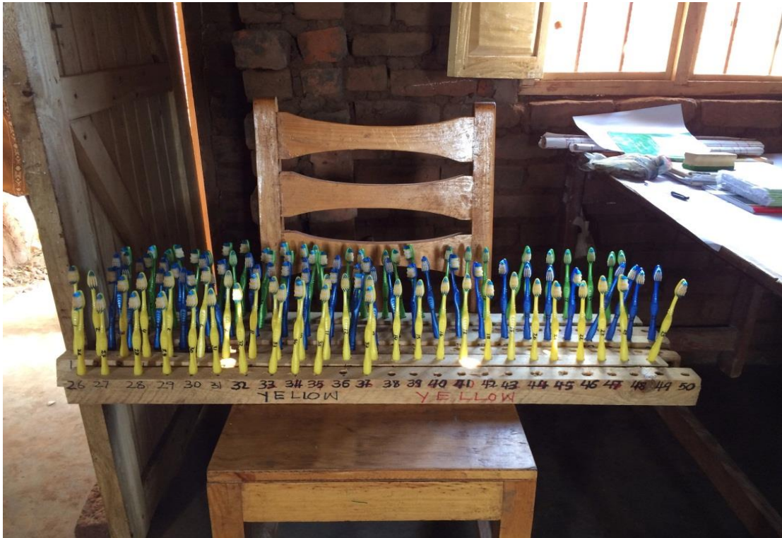
Learners Toothbrush Storage Rack with Each Learners Number indicated