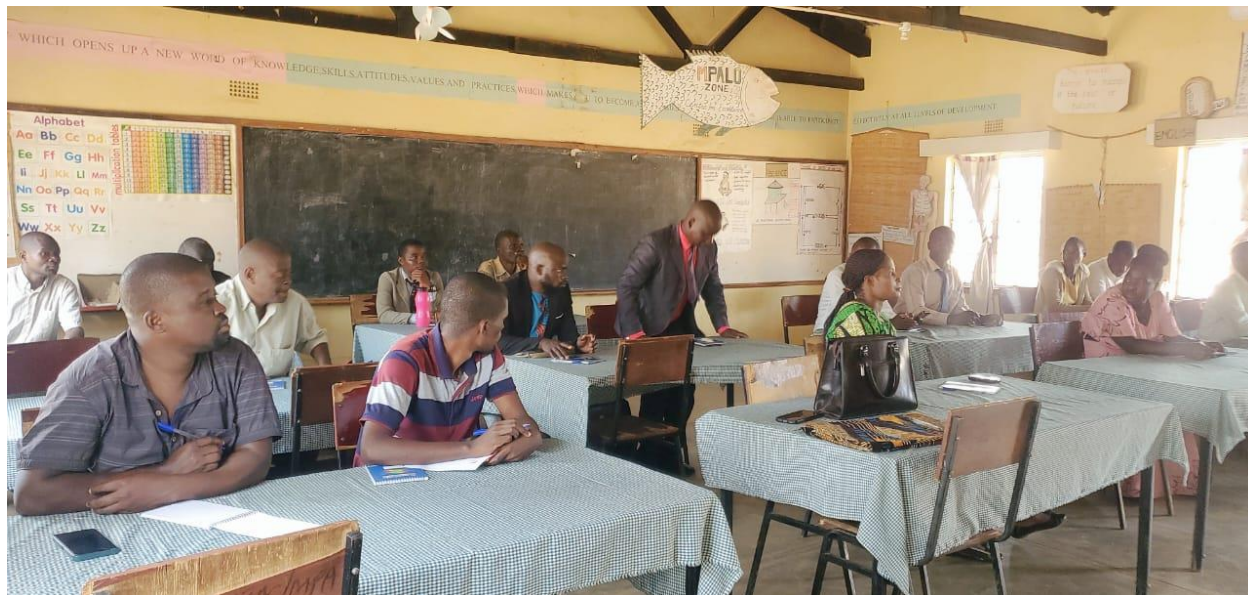
WBS Training Session in progress at Mpalo Teachers Development Centre (TDC)