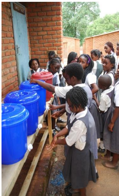
Hand-washing in progress